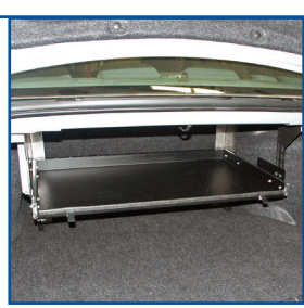
Trunk Mounting Solutions Provides an ideal equipment mounting surface for the '0607 Impala. Heavy-duty bearing slide allows easy access to OEM spare tire.